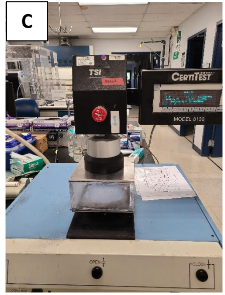
Fig. 2C. TSI 8130 Filter Tester