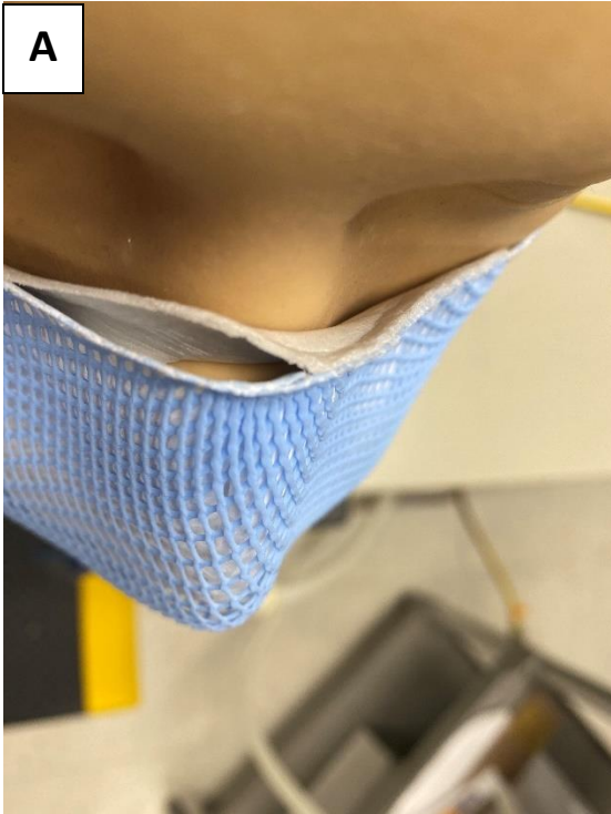
Fig. 1A. Treated Sample 14 Foam Nosepiece