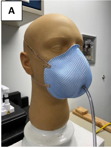
Fig. 2A. Large Static Advanced Headform