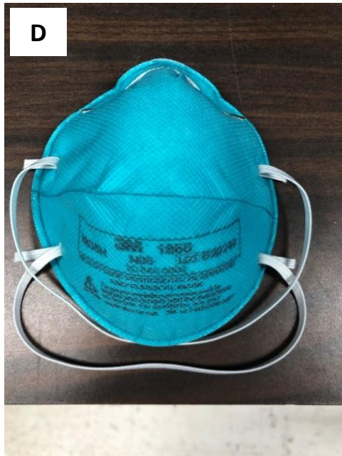
Fig 1D. Printed Information-Sample