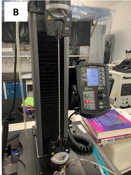
Fig 1B. Instron 5934 Tensile Tester