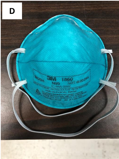
Fig 1D. Printed Information-Control