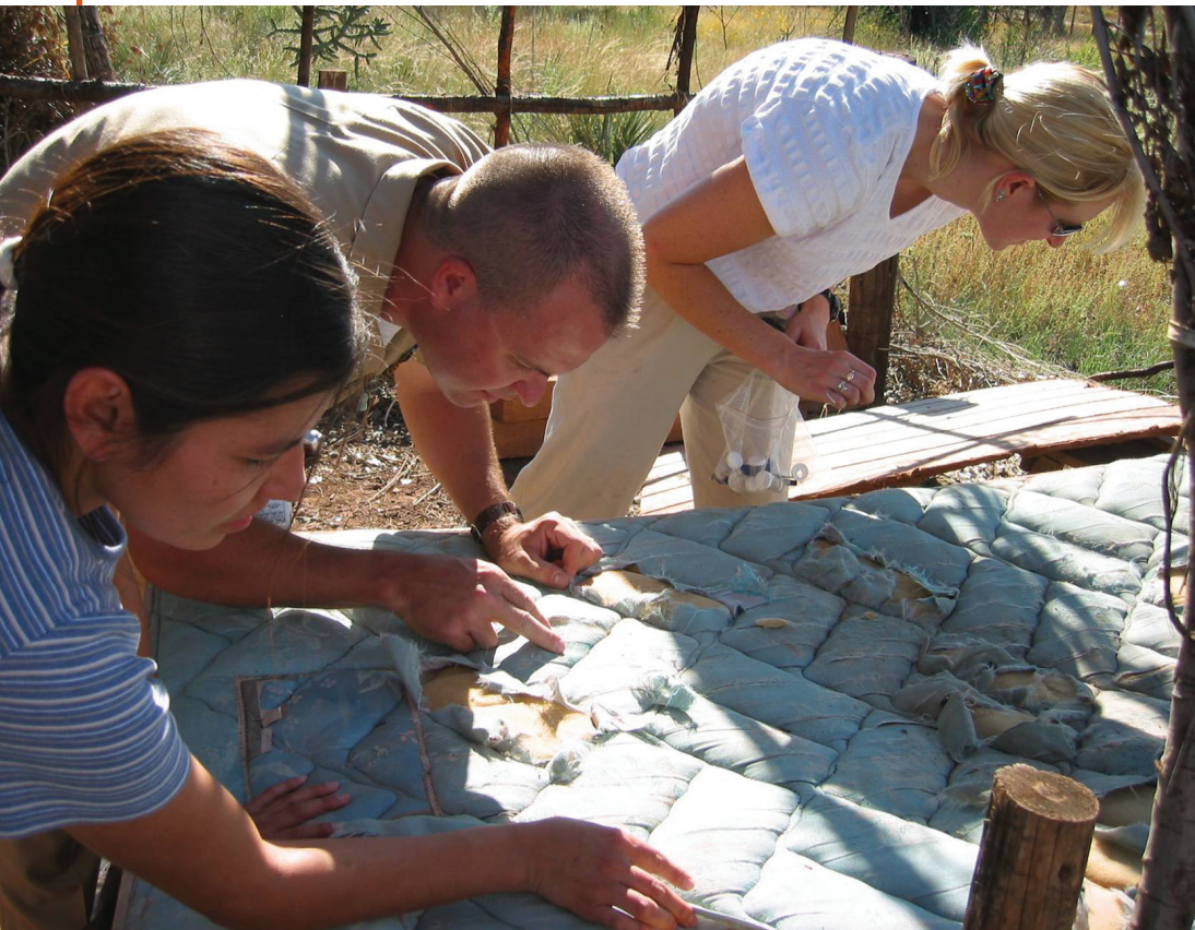
CDC scientists investigate an outbreak of Rocky Mountain spotted fever caused by an unusual type of tick, the brown dog tick.