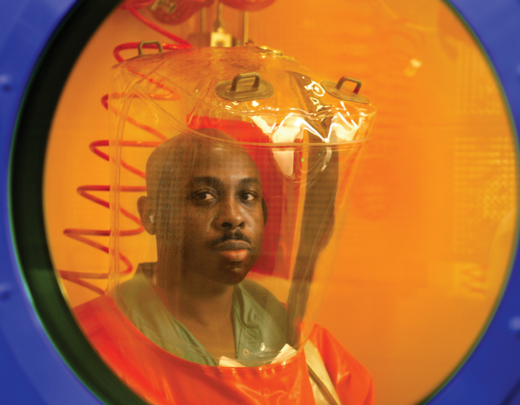
CDC staff member in the Biosafety Level 4 laboratory decontamination shower.