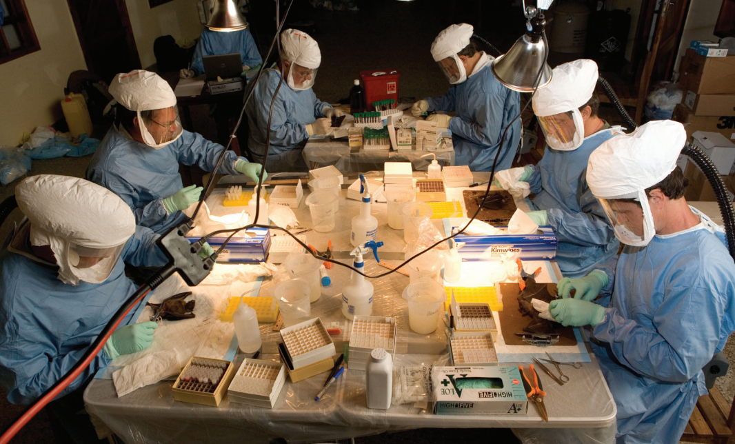
CDC scientists in 2011 study bats in Uganda to learn more about their relationship to Marburg virus which, like Ebola virus, can cause a rare but deadly hemorrhagic fever in humans and other primates.