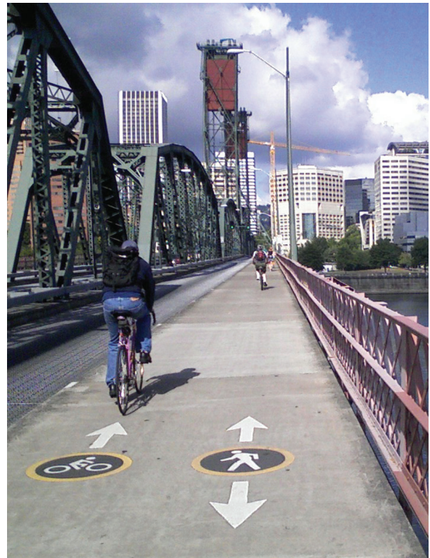
Infrastructure improvements on the Hawthorne Bridge in Multnomah County make safe, sustainable, and equitable transportation options available to all users.

With health equity as a driving principle, STARS gives credit for meaningful engagement of the communities most affected by the transportation project. Focusing