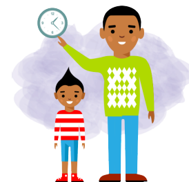
Structure and Discipline

Learning and practicing behavior therapy requires time and effort, but it has lasting benefits for the child. Ask your doctor about the benefits of parent training in behavior therapy for young children with ADHD.