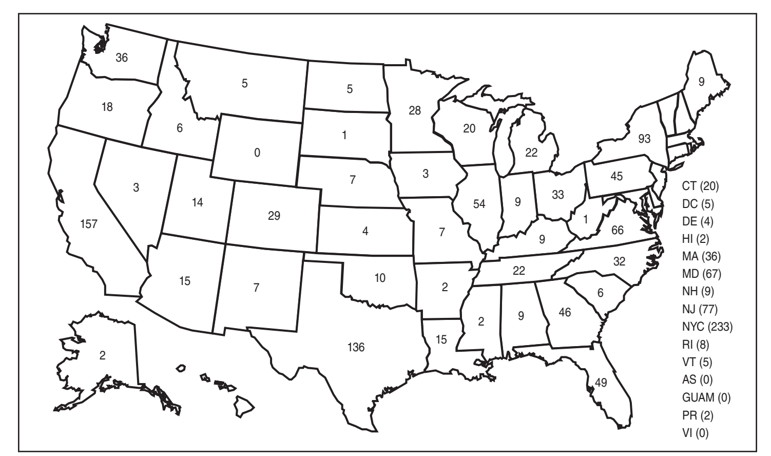
FIGURE 1. Number of malaria cases,* by state in which the disease was diagnosed — United States, 2007