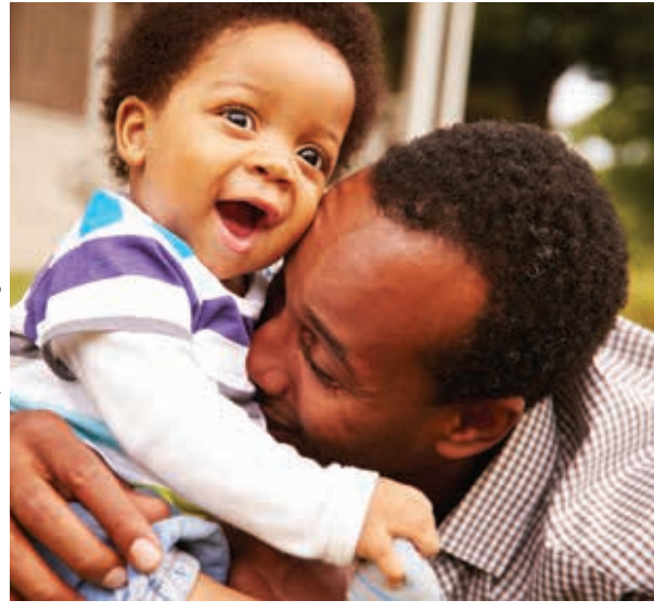
Infants and toddlers have very limited capacities for selfregulation, and thus require the support of caregivers for support to manage their attention, feelings, and behavior.

have positive relationships with the adults in those settings. In addition to creating a positive climate for learning, these teachers encourage the child's effort, persistence, and mastery through verbal comments and by working alongside the child, especially as they engage in open-ended conversations about the child's interests and experiences. Children who develop positive relationships like these are more excited about learning, more enthusiastic, and more self-confident.