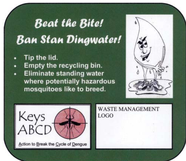
Figure 2. Cartoon character used in public relations campaign to control dengue outbreaks, Florida, USA, 2009–2011.

Second, we recommend that public health agencies involved in responding to an outbreak of dengue