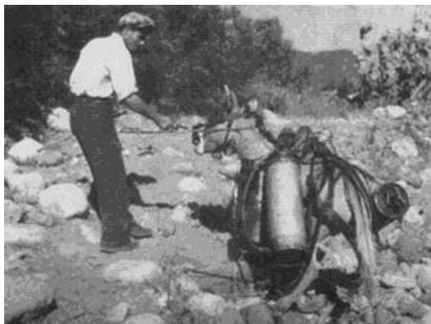
Figure 1. Donkeys used to transport equipment and larvicide in hilly territory, Sardinia, 1948–1950. Photograph by Wolfgang Suschitzky. Reprinted with permission from Istituto Etnografico della Sardegna.

Additional problems were created by the tensions of the Cold War (continuing state of conflict, tension, and competition after World War II) (25). On July 2, 1947, the