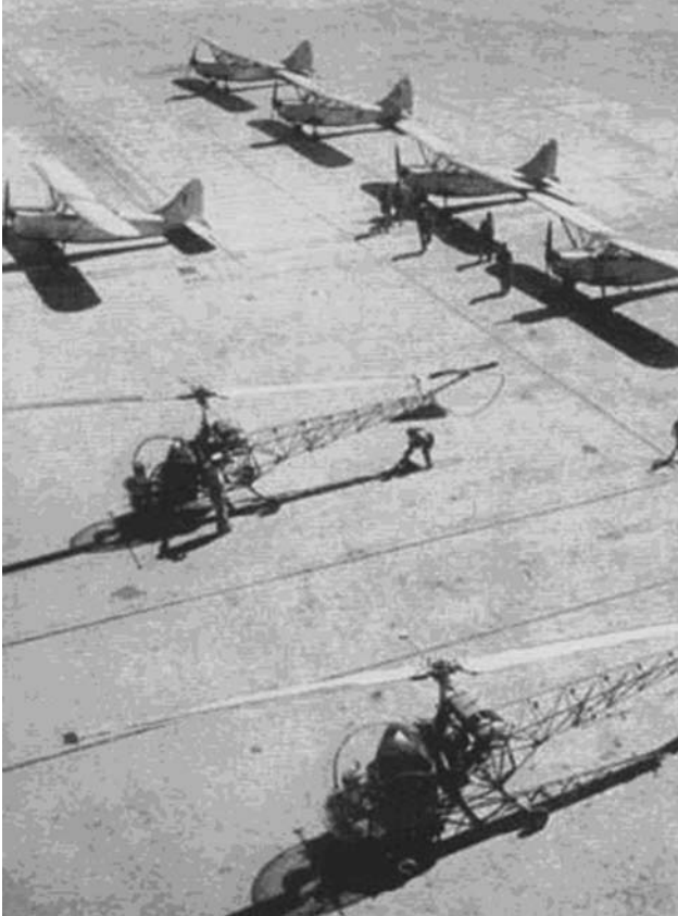
Figure 4. Aerial spraying of DDT in Sardinia, 1948.

this study argued that expansion of the cohort and collection of information are needed to clarify these findings. No studies of the environmental effects have been conducted.