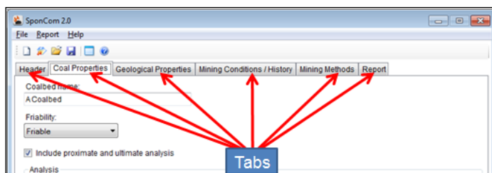
Figure 1. SponCom 2.0 tabs.

The original SPONCOM program (1.0) was developed by the National Institute for Occupational Safety and Health (NIOSH) to aid its researchers and U.S. Mine Safety and Health Administration (MSHA) personnel, mining operators, and consultants in the assessment of the spontaneous combustion risk in an underground mining operation. To develop the program, information was gathered from the literature, from interactions with experts in ground control, ventilation, and geology, and from mine personnel who have experienced self-heating events at their operations. The information from these sources was correlated with NIOSH's experimental studies (on the self-heating tendencies of coals) to form the knowledge base for the program. SponCom 2.0 uses the same data inputs and analyses algorithms as the original SPONCOM program, but improves the user interface.