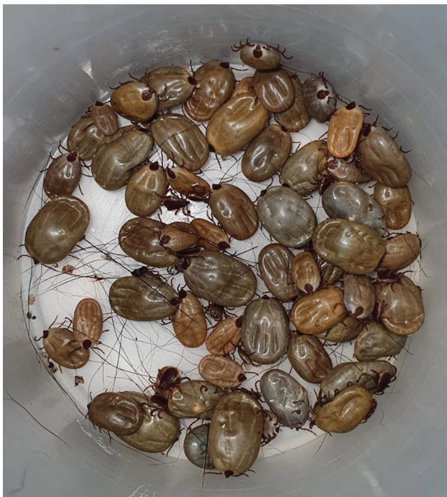
Figure. Brown dog ticks collected by the vector control department of Nuevo Leon, Mexico, in a hard-to-reach municipality.

The work on which this report is based was carried out at the Secretary of Health of Nuevo Leon.