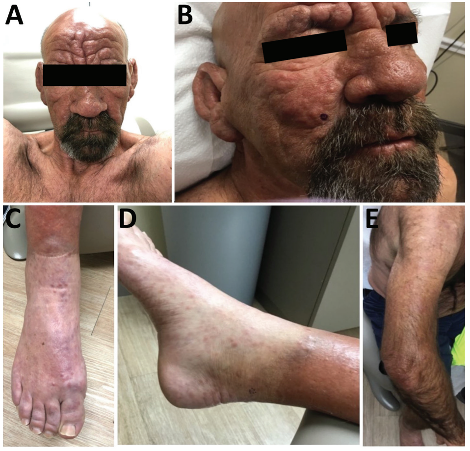
Figure. Lepromatous leprosy in a 54-year-old man in central Florida, USA, 2022. A, B) Leonine facies with waxy yellow papules. C) Violaceous nonblanching macules coalescing into patches along dorsum of feet bilaterally. D, E) Erythematous papules coalescing into plaques along extensor aspects of upper and lower extremities bilaterally. Plaques notably demonstrated a moderate degree of dysesthesia.

Transmission of leprosy has not been fully elucidated. Prolonged person-to-person contact through respiratory droplets is the most widely recognized route of transmission (1). A high percentage of unrelated leprosy cases in the southern United States were found to carry the same unique strain of M. leprae as nine-banded armadillos in the region, suggesting a