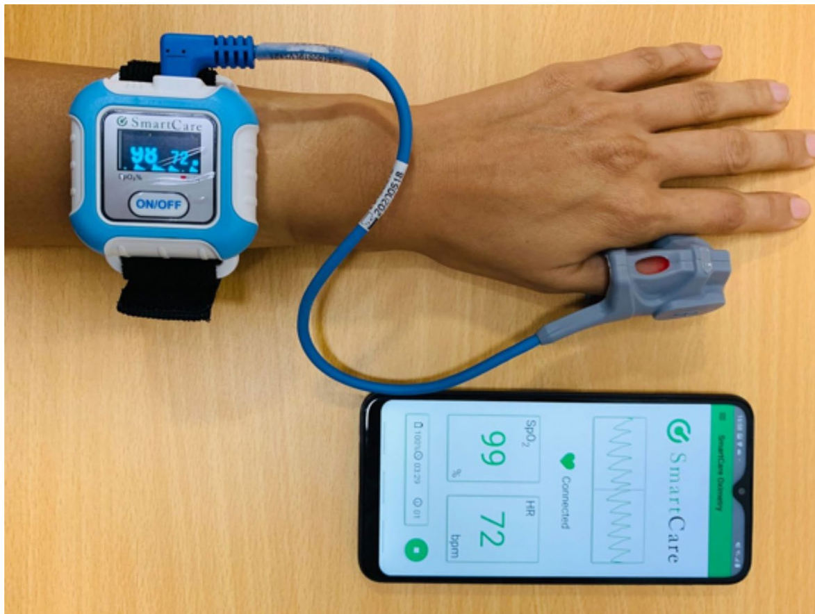
Appendix Figure. Wearable pulse oximeter device and smartphone display used for remote patient monitoring for monkeypox virus infection in 2 female travelers returning to Vietnam from Dubai, United Arab Emirates, 2022. The wearable device reduces clinical staff contact with patients.

*T7171, threonine to isoleucine in amino 717