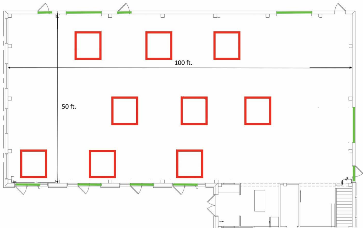
Appendix Figure 1. Diagram of interior of gym space that was part of investigation. Green lines indicate conventional and overhead garage doors that were at least partially open; red boxes indicate athlete workout stations.

trainer spent several minutes explaining the workout and then led the class through various exercises, voicing instructions loudly and walking throughout the space. The day the trainer received his positive test result, the gym owner contacted the 50 class participants to notify them of their potential exposure. The health department communicated with the gym owner 2 d later, on September 30, 2020, and did not initiate tracing because those exposed did not meet the definition of close contacts ( \leq 6 ft for \geq 15 min). During subsequent follow-up by the gym owner for 14 d after the last exposure, none of these 50 persons reported any coronavirus disease (COVID-19) symptoms. Five elected to get tested for SARS-CoV-2 \leq 7 d of notification and tested negative by real-time reverse transcription PCR.