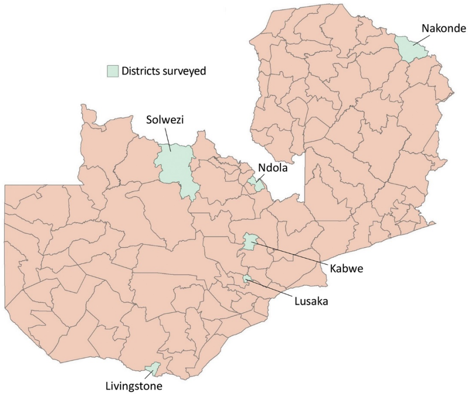
Appendix Figure 2. District locations for SARS-CoV-2 prevalence study among outpatients in six districts (Kabwe, Livingstone, Lusaka, Nakonde, Ndola, and Solwezi) in Zambia, July 2020.