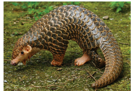
Figure. Covered in tough keratin scales interspersed with strands of fur, the pangolin, also known as a scaly anteater, assumes an impenetrable rolled-up position when threatened. Note the short muscular forelimbs. Pangolins are endangered and World Pangolin Day is the third Saturday in February. Photo of a young Chinese pangolin ( Manis pentadactyla ) by Te-Chuan Chan (Taipei Zoo, Taiwan) and Wen-Ta Li (Pangolin International Biomedical Consultant Ltd., Taiwan)

Linnaeus named the genus Manis , derived from manes , Latin for “spirits” or “ghosts or shades of the dead,” which refers to their noncuddly reptilian persona and solitary nocturnal foraging. Covered by keratin scales, pangolins, when threatened, assume a rolled up position, described by the Malay word pengguling (one who rolls up). Native to Java (thus javanica ), their habitat includes Southeast Asia, especially the Indomalayan archipelago and Sunda Islands. Humans hunt pangolins for their meat, consume their blood as an elixir, and use their scales and other body parts as ingredients for crafting leather products and nonefficacious medications.