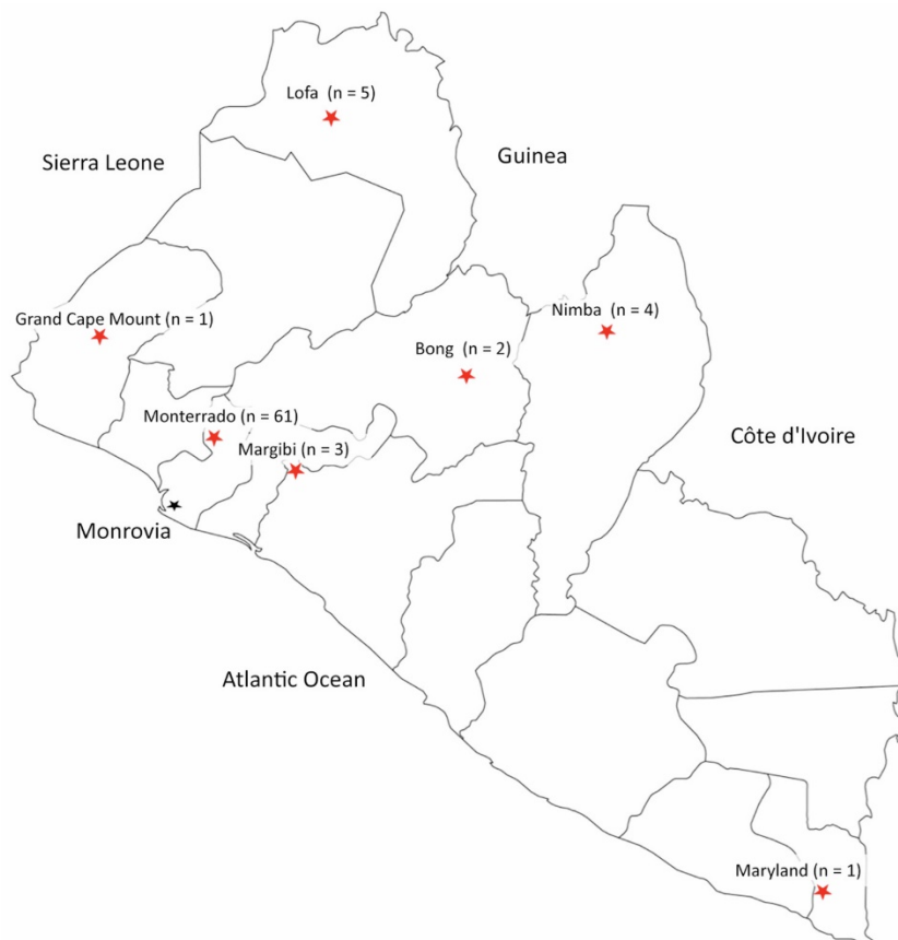
Appendix Figure 2. Sites from which nasopharyngeal swab samples were collected during a coronavirus disease case surge, Liberia, 2021. Red stars indicate locations inside counties; black star indicates the capital, Monrovia. Numbers of cases per county are indicated in parentheses.