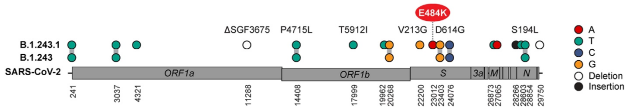
Appendix Figure 1. B.1.243.1 lineage-defining mutations on the severe acute respiratory syndrome coronavirus 2 (SARS-CoV-2) genome. Mutations are shown in reference to the SARS-CoV-2 Wuhan-1 genome position (NC_045512.2). ORF, open reading frame.