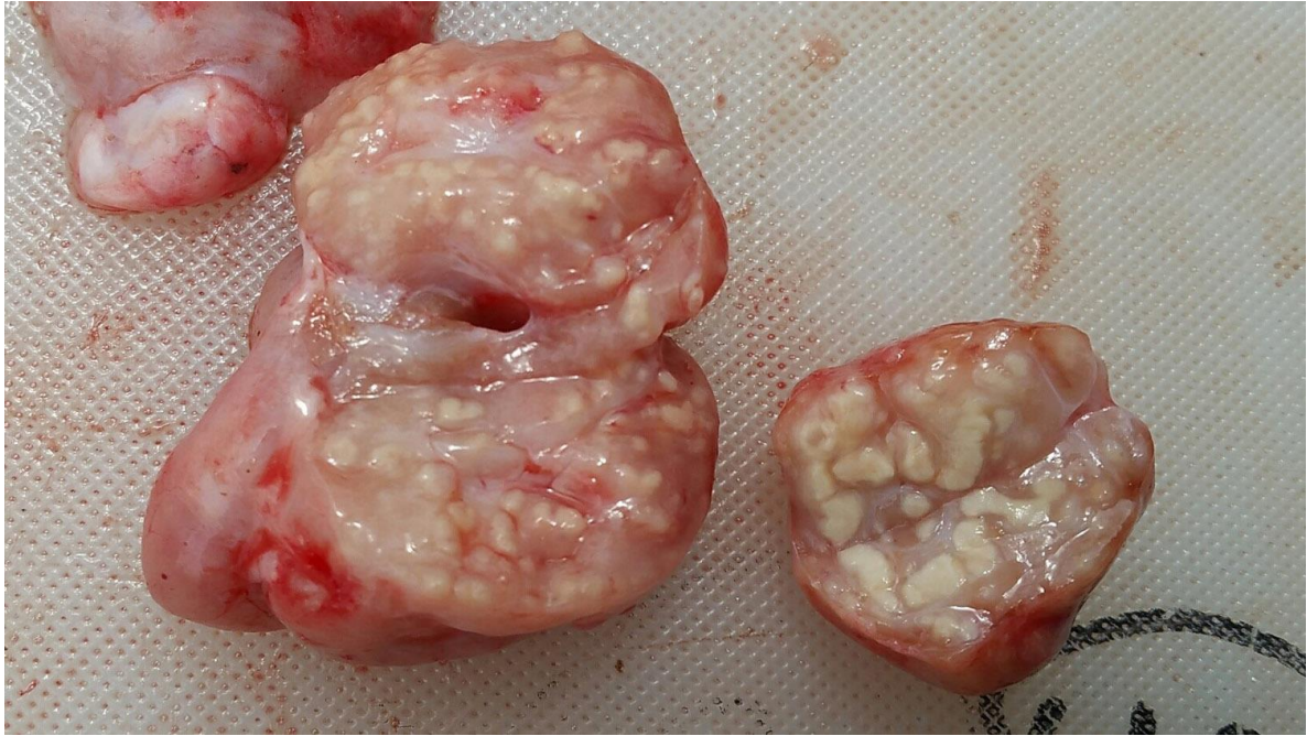
Technical Appendix Figure 2. Multifocal granulomas in the retropharyngeal lymph node of a white rhinoceros with confirmed Mycobacterium bovis infection.