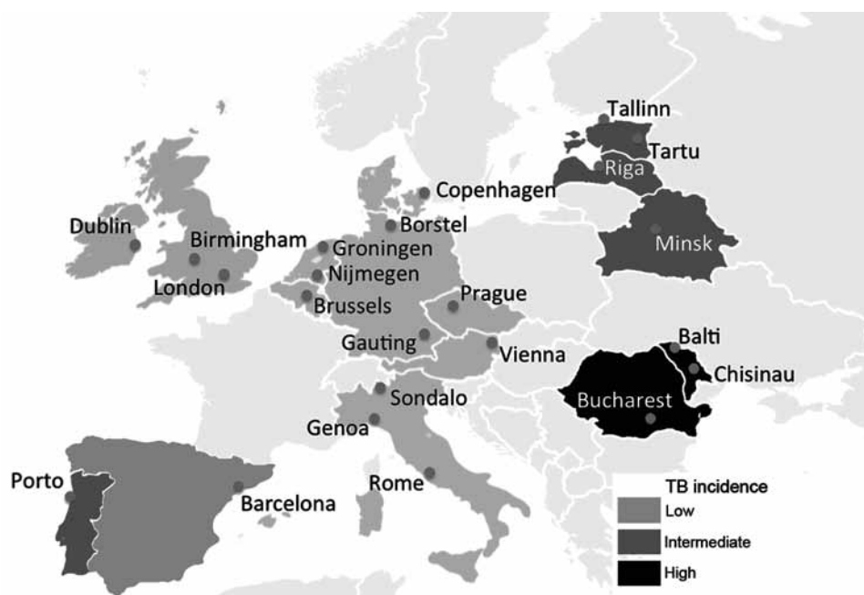
Figure. TBNET study sites in the Pan European network for study and clinical management of drug-resistant tuberculosis (TBPAN-NET) project. Stratification is based on the incidence of tuberculosis (TB) reported during 2010–2011, which matched the inclusion period of the study. Data for 2011 were obtained from the European Centre for Disease Control and Prevention (10). Low TB incidence, <20 cases/100,000 persons; intermediate TB incidence, 20–100 cases/100,000 persons; high TB incidence, >100 cases/100,000 persons.

Because of this selection process, a limited number of patients (41, 5.4%) started treatment before the study began in January 2010, but none started treatment before