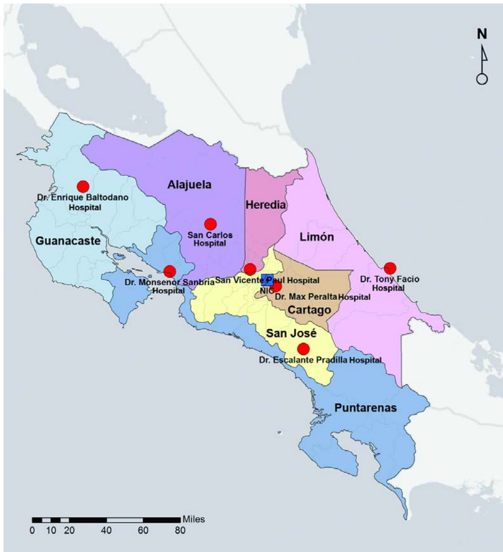
Technical Appendix Figure. National Influenza Centre and influenza sentinel surveillance sites in the provinces of Costa Rica. Square indicates National Influenza Center; circles indicate sentinel surveillance sites. Map produced by the Pan American Health Organization, Communicable Disease and Health Analysis, International Regulation by using Esri software ( http://www.esri.com ).