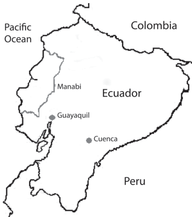
Figure 1. Three regions of Ecuador where guinea pig serum samples were obtained: Cuenca, Guayaquil, and Manabí. The country is bordered by Colombia to the north, Peru to the east and south, and the Pacific Ocean to the west. Cuenca is located in the Andes; the average annual mean temperature is 14.7°C, and the average annual relative humidity is 85%. Guayaquil is located at the head of the Gulf of Guayaquil; the mean temperature is 26.1°C, and relative humidity is 74%. The Manabí region is located on the Pacific Ocean coast; the mean temperature is 25.9°C, and relative humidity is 79%.

For antigens in the serologic analyses, we used whole viruses and recombinant hemagglutinin, nucleoprotein, and neuraminidase (subtypes N1 and N2) proteins produced in our laboratory as described (5,6). The whole viruses were A/Brisbane/59/2007 (H1N1) (Brisbane07), A/New Caledonia/20/1999 (H1N1) (Newcal99), A/Wisconsin/67/2005