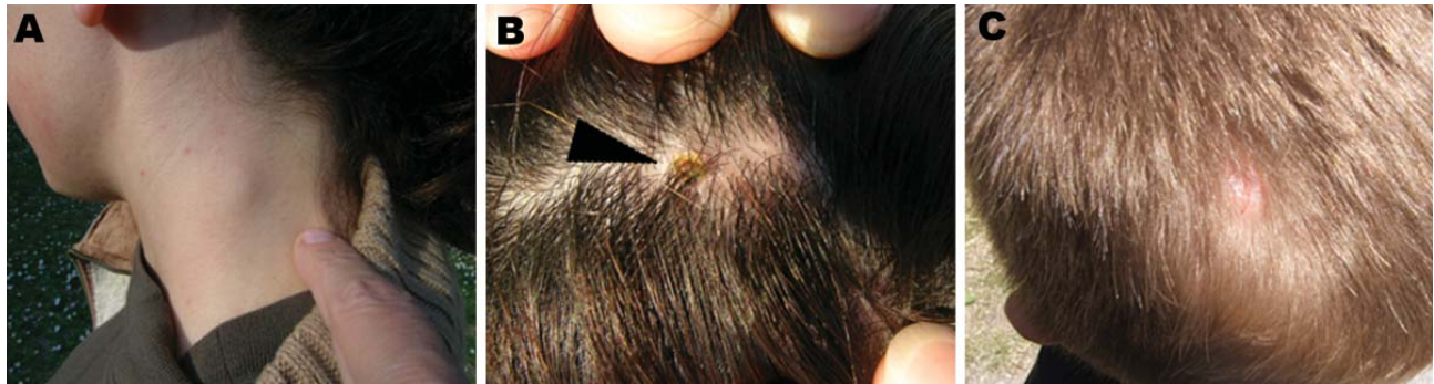
Figure 2. Enlarged lymph nodes (A), tache noire (arrowhead) (B), and alopecia (C) in patients admitted to the Lucca local health unit, Tuscany, Italy.

pathy. Pathogen identification in ticks agreed with the case definition in 50% of cases. Infected ticks were removed from 3 patients not considered to have lymphadenopathy; 1 patient showed no symptoms, probably because the tick was not attached long enough to enable pathogen transmission (TEI = 1).