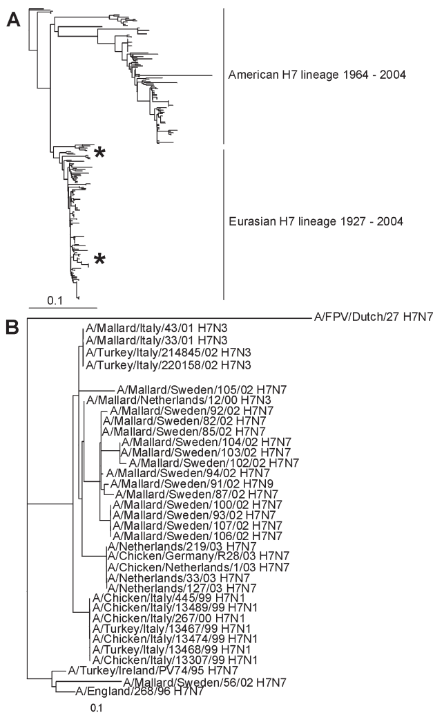
Figure 2. Phylogenetic trees of hemagglutinin H7 sequences. A) Phylogenetic tree based on the amino acid sequence distance matrix for the HA1 open reading frames of all H7 sequences available from public databases. The scale bar represents \approx 10\% of amino acid changes between close relatives. *Represents the locations of the Mallard influenza A virus isolates. B) DNA maximum likelihood tree for the European highly pathogenic avian influenza viruses and the low pathogenic avian influenza H7 influenza A viruses isolated from migrating Mallards by using A/FPV/Dutch/27 as outgroup. The scale bar represents 10% of nucleotide changes between close relatives.

rabbit antisera. The hyperimmune rabbit antisera were chosen on the basis of their ability to provide a broad response, which would recognize a wide range of strains within 1 subtype, whereas the postinfection ferret antisera were chosen on the basis of high specificity. HI assays showed that the antigenic properties of the H7 influenza A viruses from Mallards were relatively conserved, and that the HI data for the Mallard influenza A viruses did not differ significantly (i.e., up to 4-fold) from those obtained with