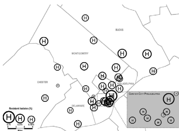
Figure 2. Geographic distribution of penicillin nonsusceptibility among pneumococcal isolates at 33 hospitals in the Delaware Valley in 1998. The figure is a proportional symbol map (bubble plot). Each hospital location is represented by a circle with an H in the center at the corresponding longitude and latitude of the hospital. The radius of the circle is directly proportional to the proportion of penicillin-nonsusceptible pneumococci at each hospital in 1998. The range is 0% to 67%. Hospitals with <10 isolates in 1998 were excluded. An insert magnifies the geographic distribution of hospitals clustered in the center of Philadelphia.

clustering is based on the assumption that rates of resistance should reflect the underlying distribution of drug resistance in the source community. Prior research has demonstrated that patients with community-acquired pneumonia are hospitalized on average <5 miles from their place of residence (16). Thus, hospitals within the same geographic region should admit patients with similar underlying rates of drug resistance. Moreover, if the pneumococcal resistance rates reported by individual hospitals should be used to guide physician antibiotic prescribing decisions for patients with community-acquired pneumococcal infections, hospitals serving similar communities should report similar rates of resistance.