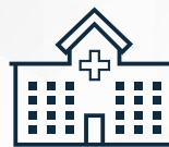
Small to Medium-sized Health Systems

HTTPS://WWW.CDC.GOV/DHDSP/EVALUATION_RESOURCES/INDEX.HTM